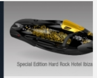
Special Edition Hard Rock Hotel Ibiza