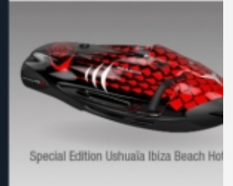
Special Edition Ushuaia Ibiza Beach Hotel